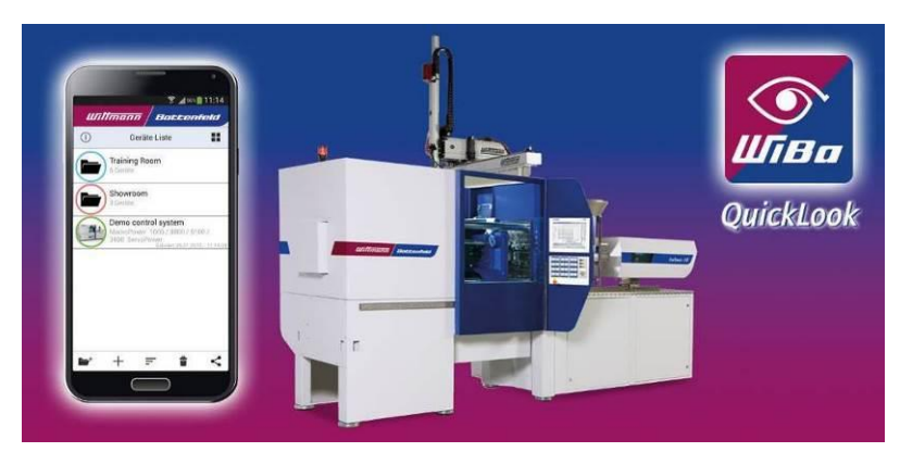
Fig. 4: The WiBa QuickLook app for simple status checks of machines and robots