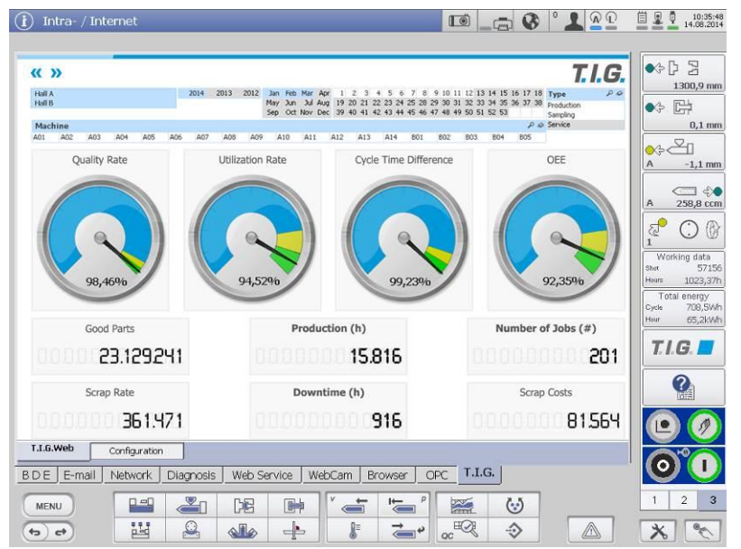
Fig. 3: Injection molding machine as an MES control terminal to check the most important parameters